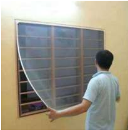
Netlon wire mesh with valcro