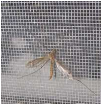
Wire mesh Stainless steel/ iron