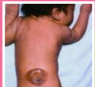
Neural Tube Defect